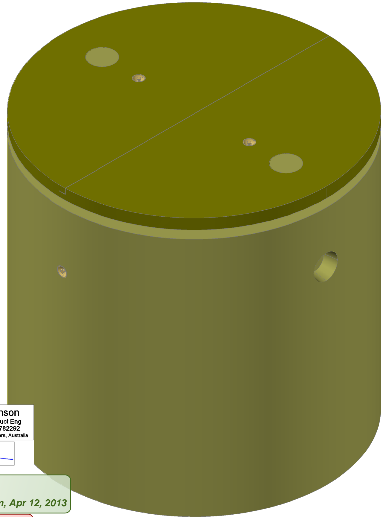
ISOMETRIC VIEW DOUBLE LID 1:5